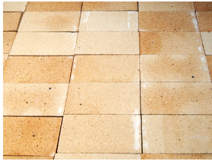
Replaceable Fire Bricks