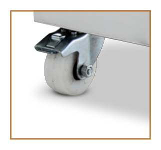
Lockable Heavy Duty Wheels