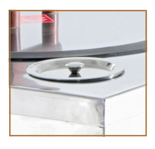
Stainless Steel Basting Bowl