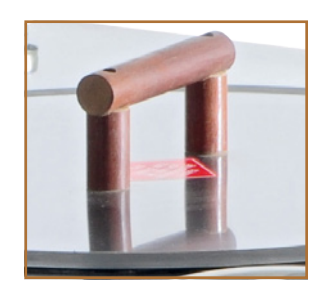
Heat Resistant Handle on Mouth Cover