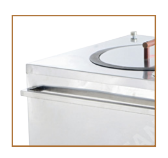
Stainless Steel Towel Hanger