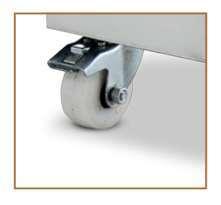
Lockable Heavy Duty Wheels