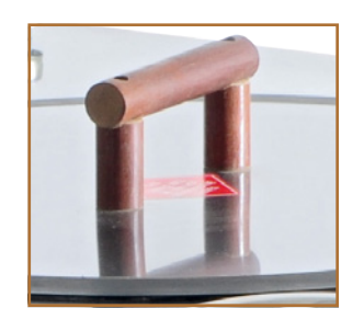
Heat Resistant Handle on Mouth Cover