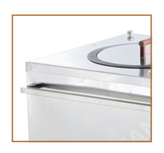
Stainless Steel Towel Hanger