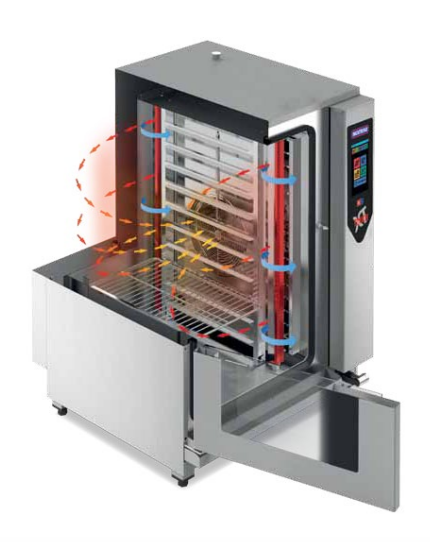
XT Optiflow Airflow technology ensures even uniform cooking