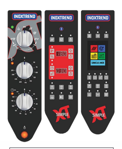
Versatile Manual, Programmable & Touch Screen Control Panels