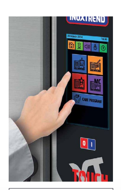
Innovative XT Touch Key Touchscreen Interface