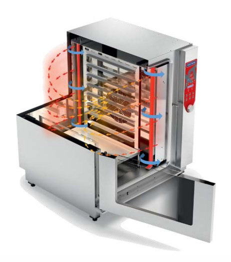
XT Optiflow Airflow technology ensures even uniform cooking