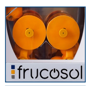
Controlled pressure squeezing