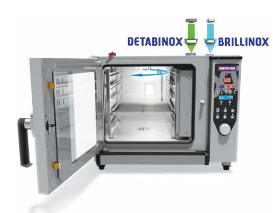
XT Simcleaner Automatic Cleaning Tablet Washing System