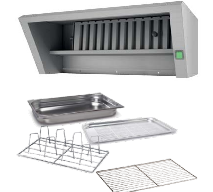
Wide range of optional accessories and equipment