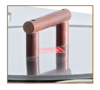
Heat Resistant Handle on Mouth Cover