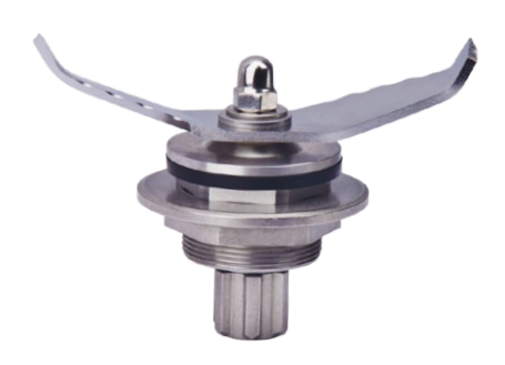
Heavy Duty Commercial Thick Cutting Blades with Wave Design