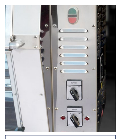
Easy On/Off & High/Low Controls