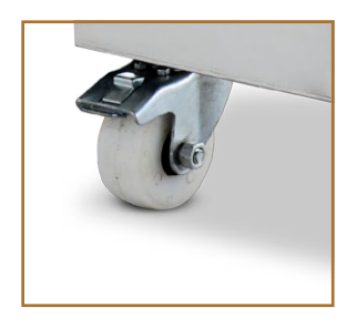
Lockable Heavy Duty Wheels