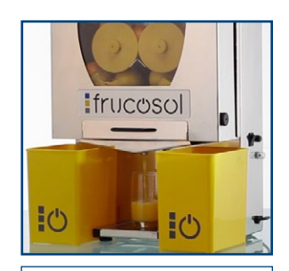
Dispense juice to glasses, carafes, pitchers & bottles