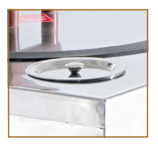
Stainless Steel Basting Bowl