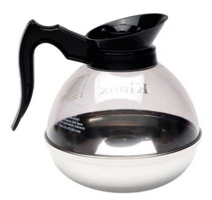
CP003 Aluminium Base Pot