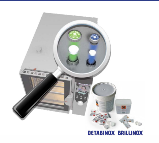
XT Simcleaner Automatic Cleaning Tablet Washing System