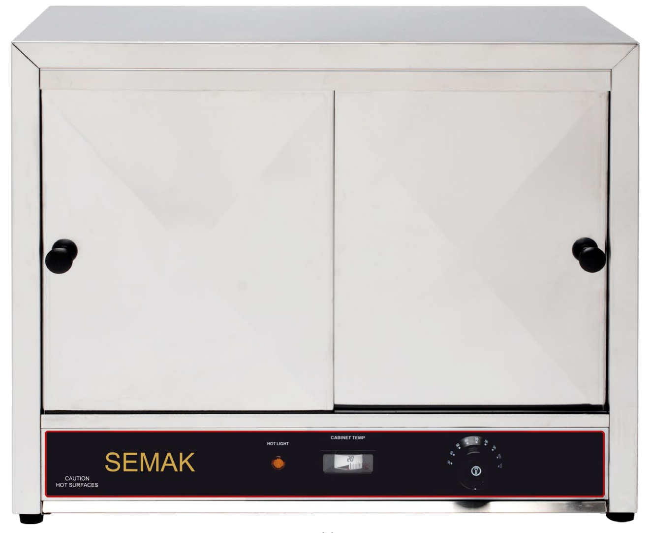
PW50B Builders Pie Warmer