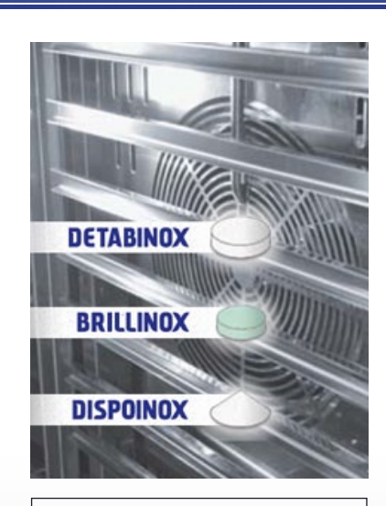
XT Simcleaner Automatic Cleaning Tablet Washing System