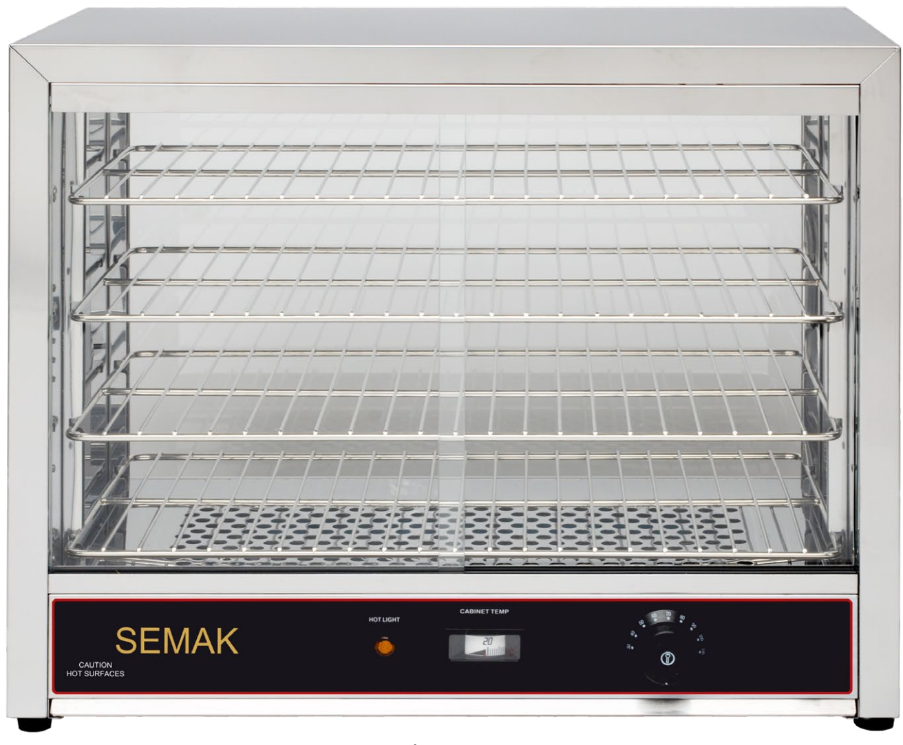
PW50 Glass Pie Warmer

With superior design and proven reliability in Australian conditions, Semak Pie Warmers are designed for high volume commercial use in environments such as canteens, schools, clubs, function centres, the construction industry and retail outlets.