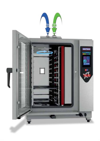
XT Simcleaner Auto Cleaning Tablet Washing System