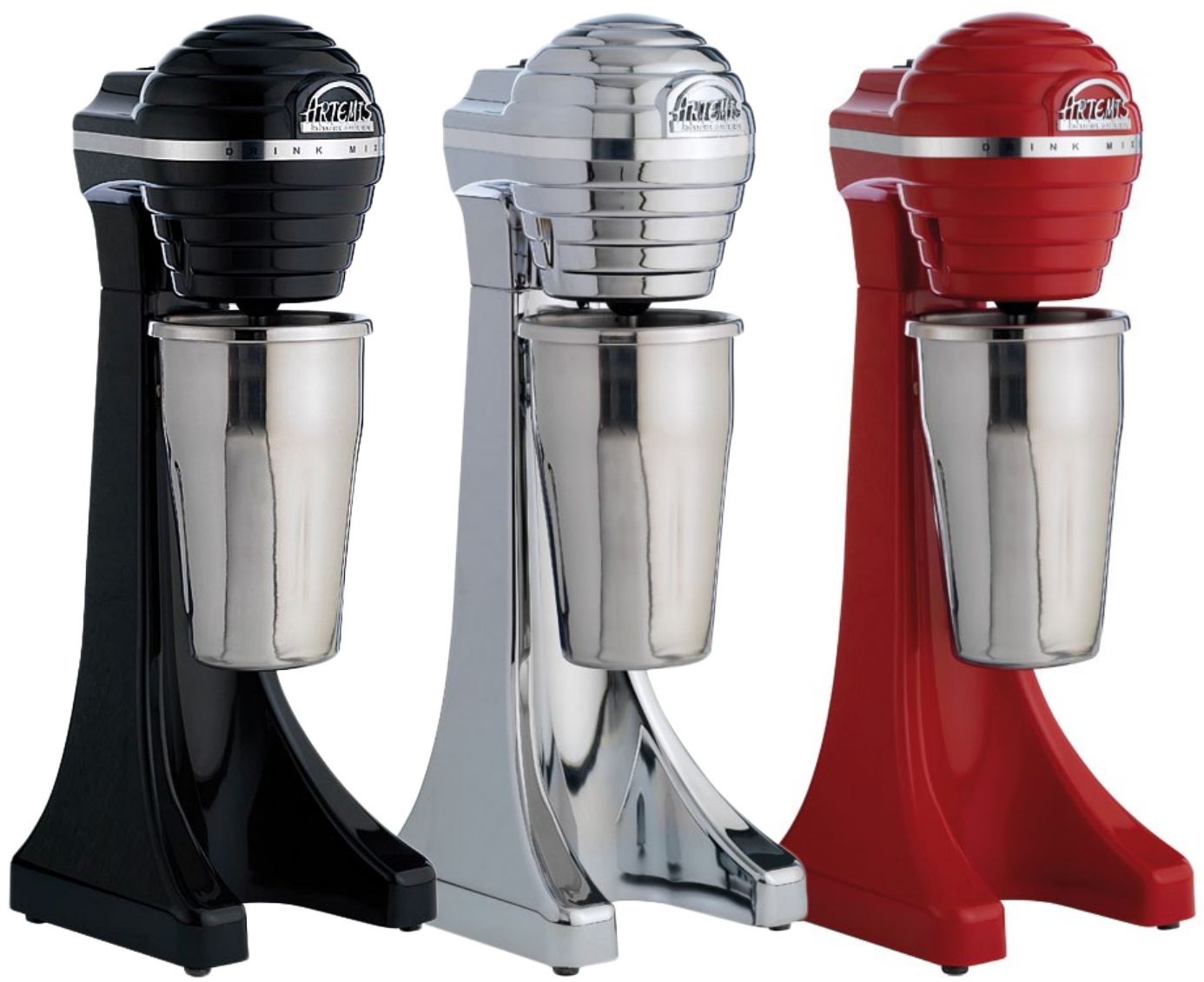
VSAR-B VSAR-C VSAR-R