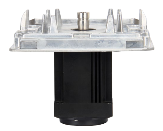
All New Brushless Suspension Motor with Durable Metal to Metal Drive Coupling