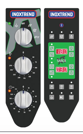
Programmable and Mechanical control options