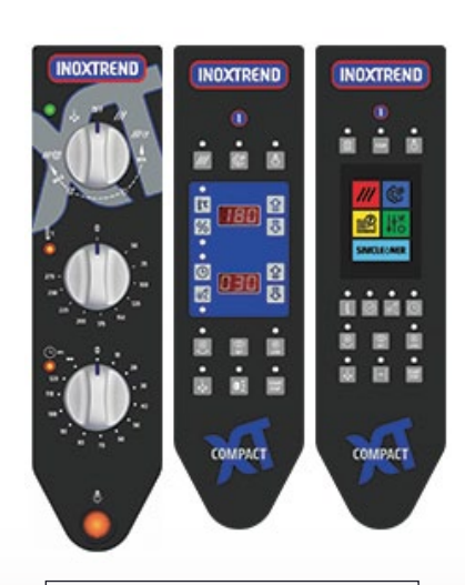
Versatile Manual, Programmable & Touch Screen Control Panels