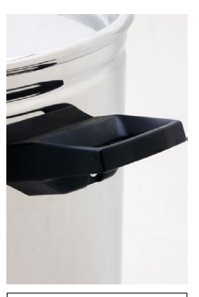
Heat Resistant Handles