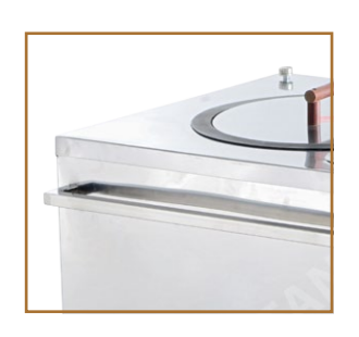
Stainless Steel Towel Hanger