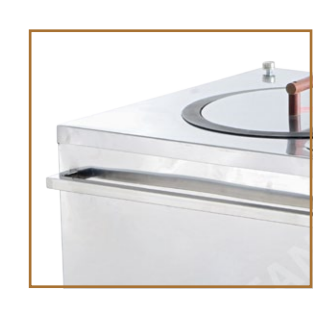
Stainless Steel Towel Hanger