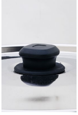
Heat Resistant Knob