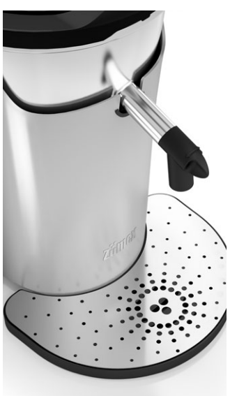
High Efficiency Micromesh Filter