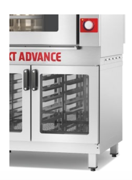
Optional Integrated Prover with dedicated temperature control