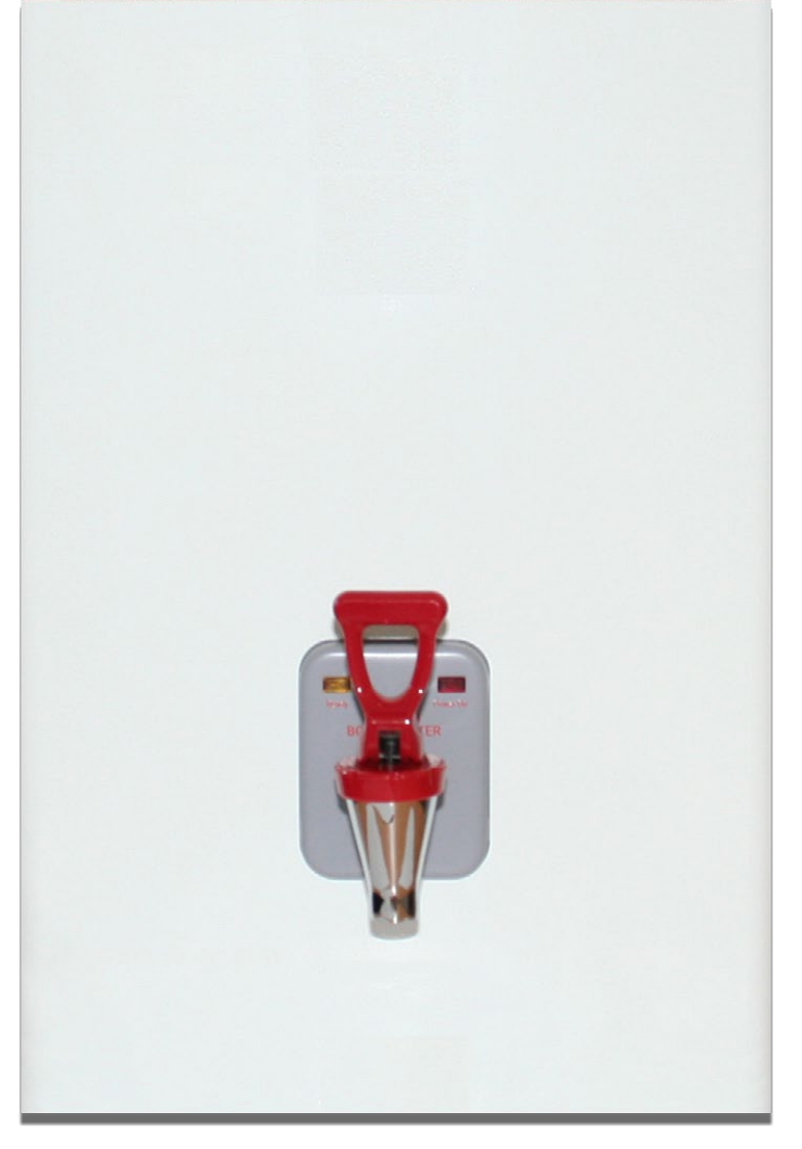
White Powder Coat Finish