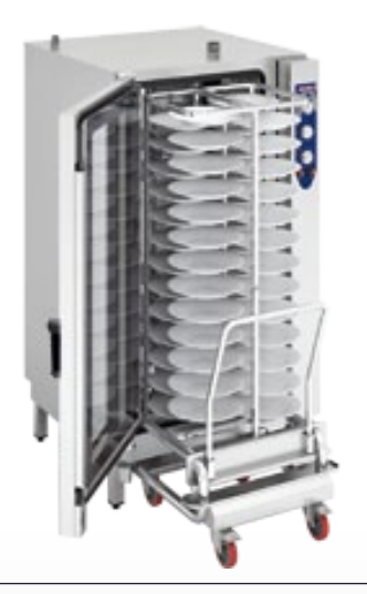
Wide range of optional accessories and equipment