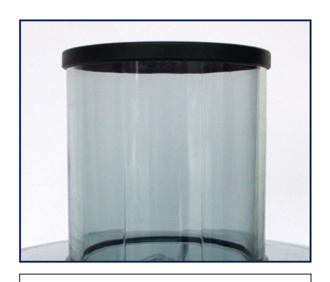
Large 76mm Diameter Feeding Chute