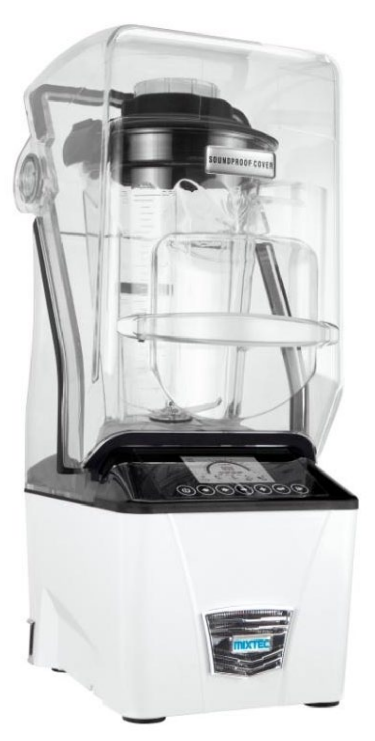
Fitted with Sound Cover