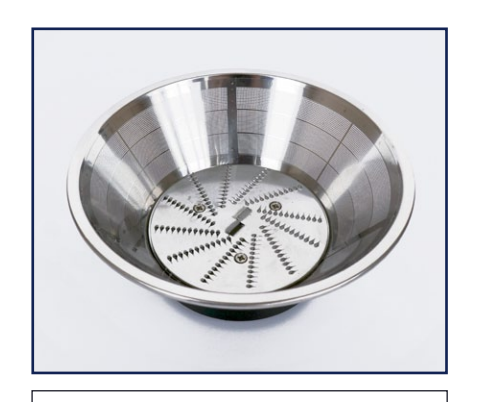
Ultra Efficient Micromesh Filter Basket