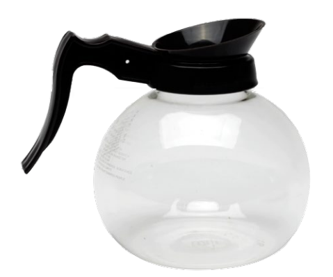
CP002 Glass Coffee Pot