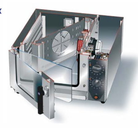
XT Boxtor generates and retains heat inside the cooking chamber