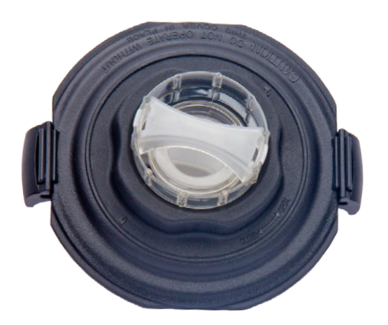
Lock On Three Layer Sealing Lid with Ingredient Adding Lid