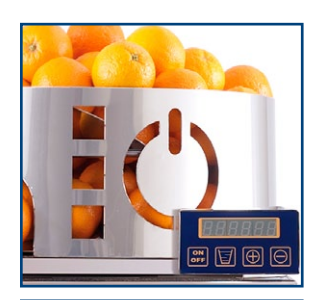
Digital controller option with fruit counter